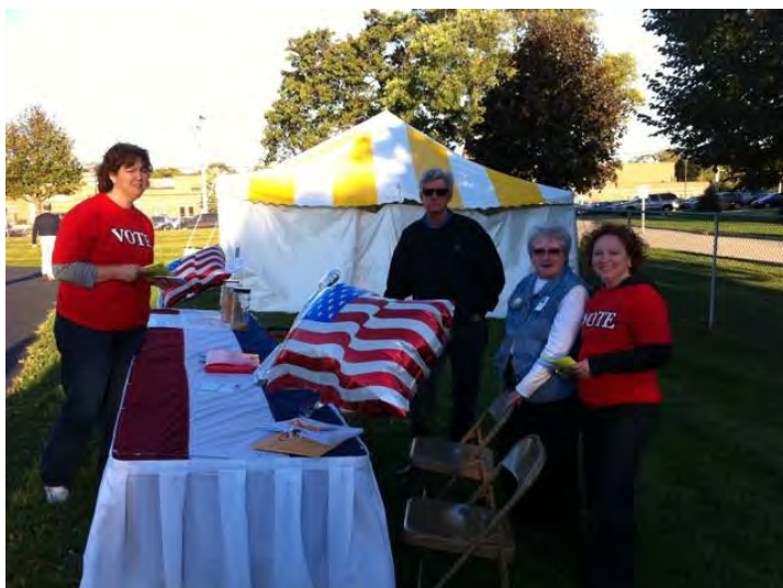
Voter Registration at Community High School Homecoming